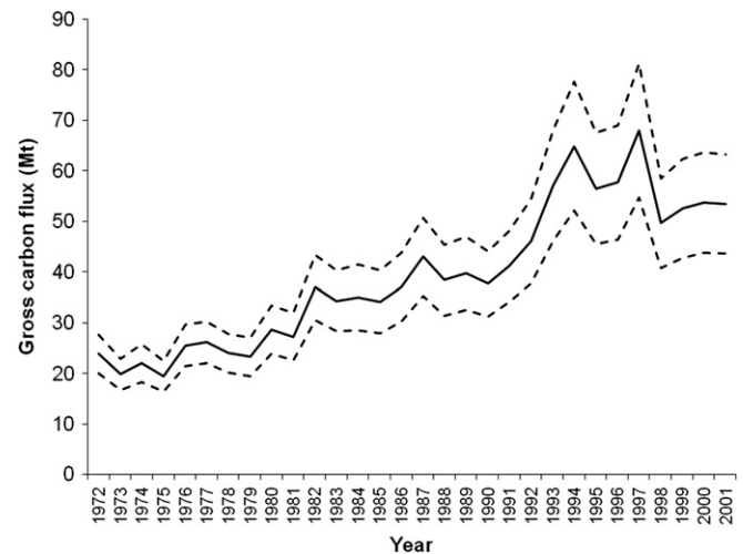
Fig. 2. PNG gross annual carbon flux from deforestation and degradation (Mt) 1972–2002. The solid line shows the best estimate, with the dashed lines above and below representing the upper and lower estimate respectively.

Our results suggest that while it is possible to generate a range of estimates for carbon storage (4142–5399 Mt, Table 2) and flux (966–1390 Mt between 1972 and 2002, Table 3) from a variety of source datasets, there remains a high degree of uncertainty regarding their actual value. Most of the uncertainty in our estimate of carbon stocks (Table 2) was associated with measurement of unlogged biomass, because the area of unlogged forest in 2002